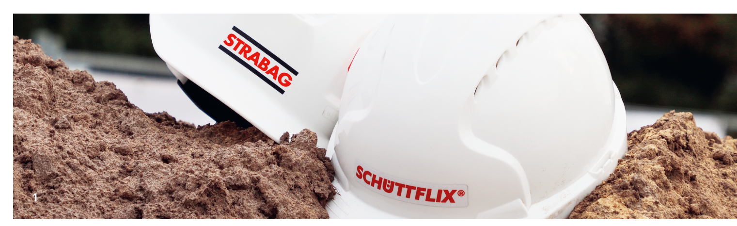
\textbf{1} \; \mathsf{STRABAG} \; \mathsf{and} \; \mathsf{Sch\"{u}ttflix} : \mathsf{digitalising} \; \mathsf{the} \; \mathsf{construction} \; \mathsf{industry} \; \mathsf{together}.